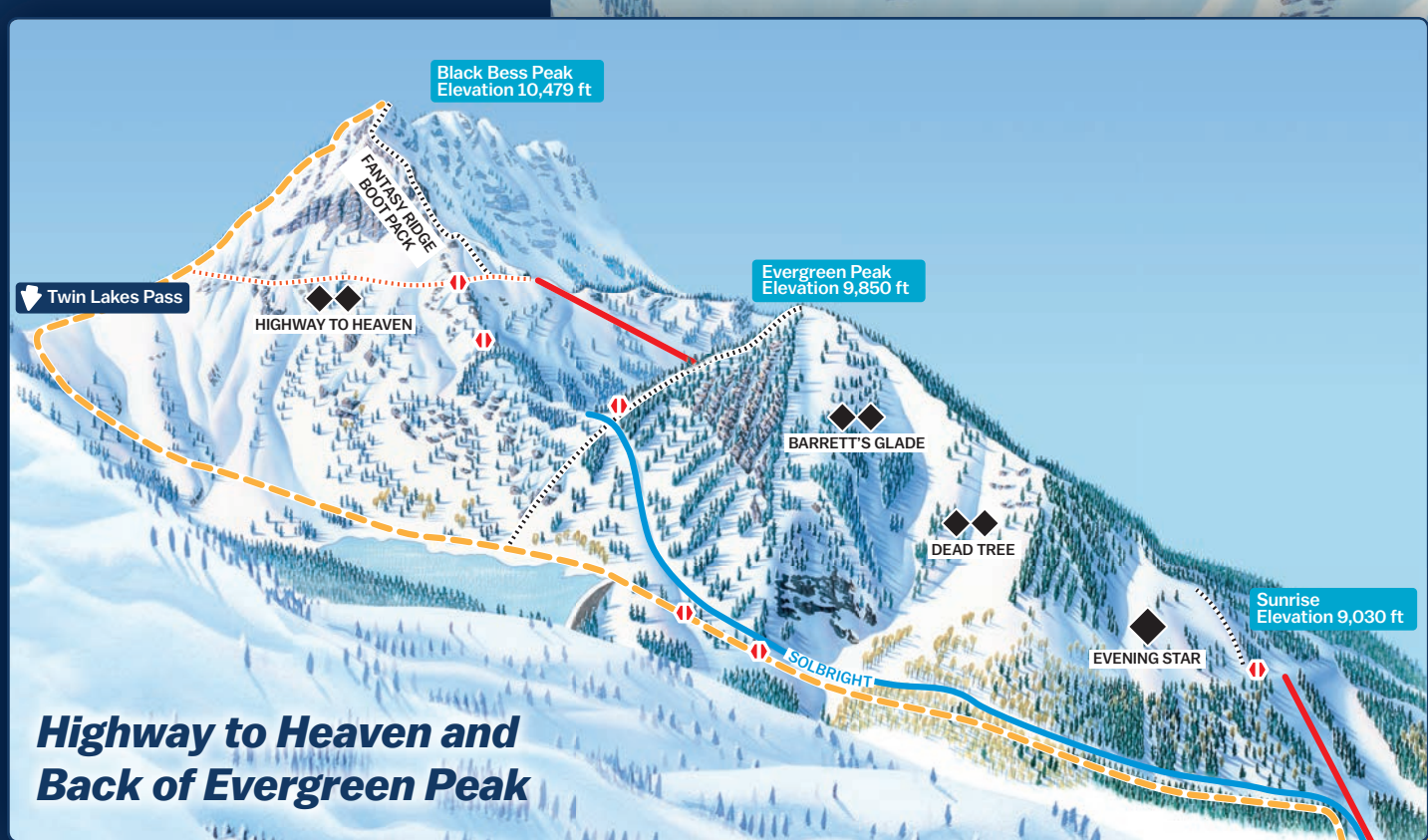
Highway to Heaven and Back of Evergreen Peak