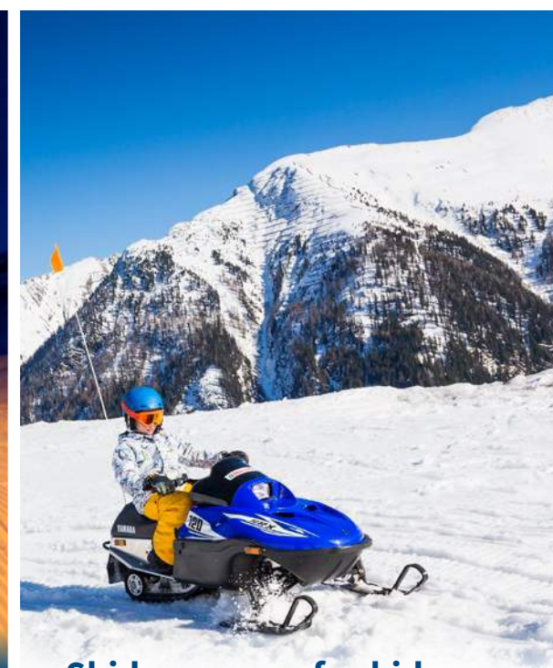
Skidoo course for kids on toboggan evenings