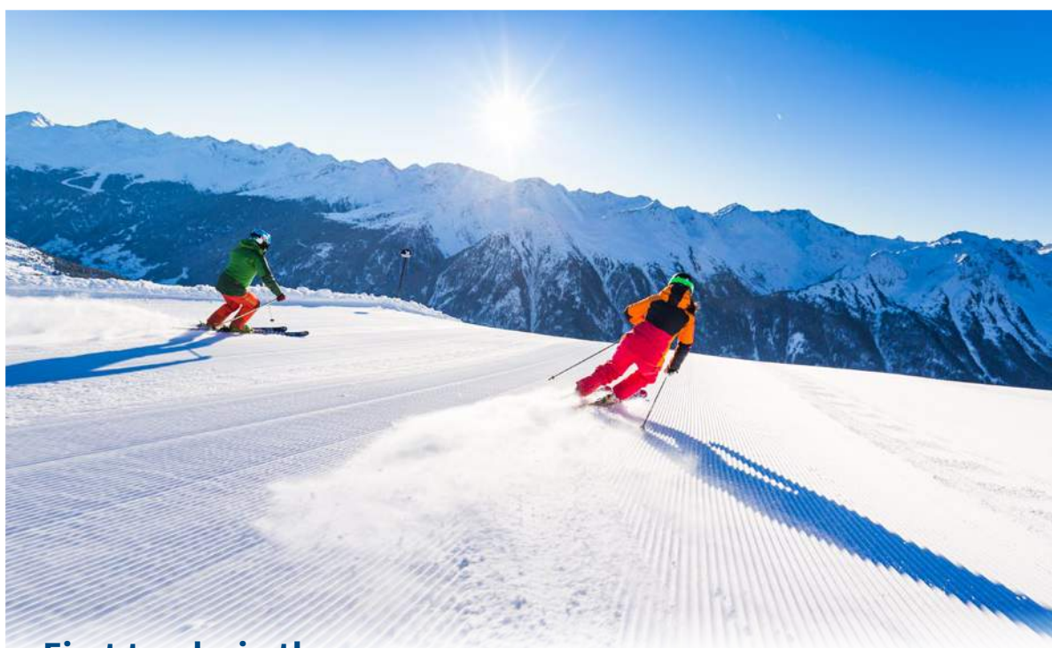
First tracks in the snow Every Monday starting already at 8 AM