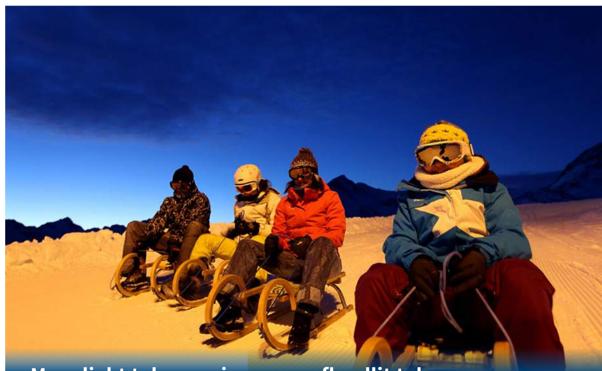
Moonlight tobogganing on our floodlit toboggan run Every Tuesday. Offer & Packages see tariff booklet or www.kappl.com