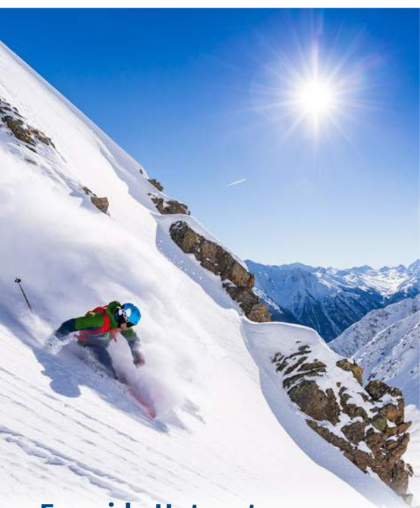
Freeride Hotspot First Line Experience