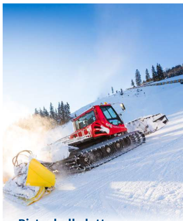
Pistenbully lottery on toboggan evenings