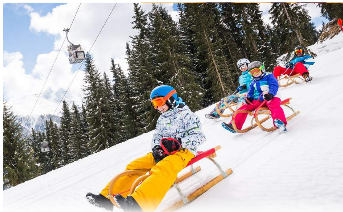
Toboggan run - length 6 km Daily tobogganing fun for all ages!