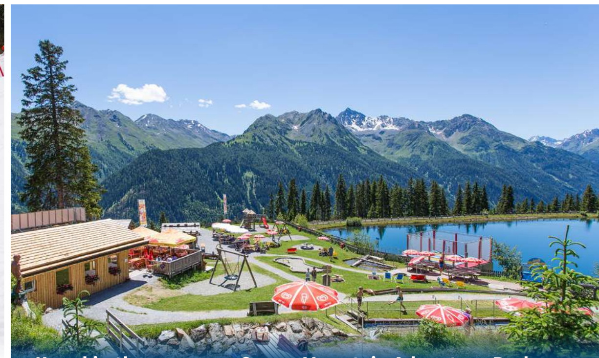
Kappl in the summer - Sunny Mountain Adventure Park Visit us in summer - great highlights for adults and children are waiting for you!

Visit us on facebook: facebook.com/kappl.tirol